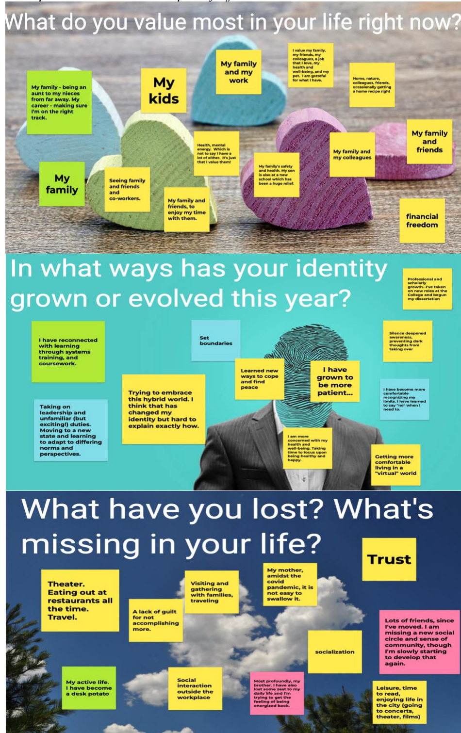
Figure 2 Prompts to Honor the Multiplicity of Emotions

These kinds of responses led us to consider the human need for belonging as a part of teaching. In the following section, we offer implications for how university-school partnerships